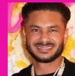
PAUL "PAULY D" DELVECCHIO