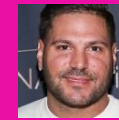
RONNIE ORTIZ- MAGRO