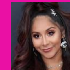
NICOLE "SNOOKI" POLIZZI