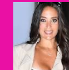
SAMMI "SWEETHEART" GIANCOLA