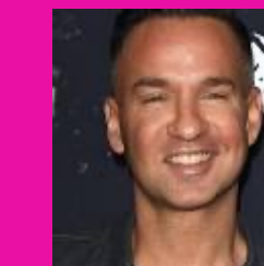
MIKE "THE SITUATION" SORRENTINO