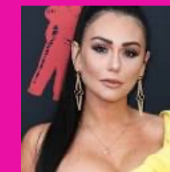
JENNI "JWOWW" FARLEY