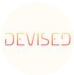
Devised Sales Agents Spain, Latin America info@devised.tv

Albatross World Sales Chopinstrasse 8 - 04103 Leipzig, Germany Tel: +49 (0)341 4428 2450 Email: info@albatrossworldsales.com www.albatrossworldsales.com